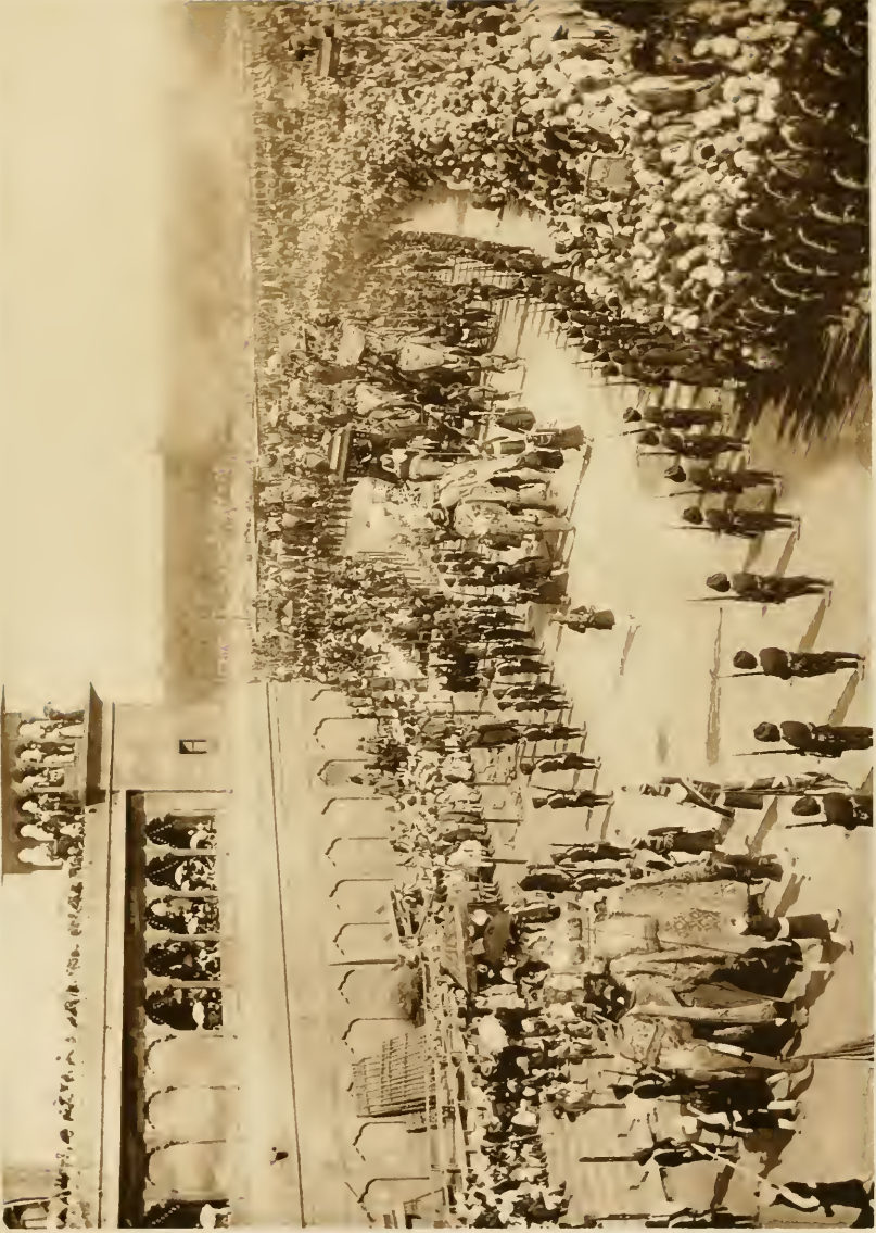
(Duke & Duchess of Connaught)